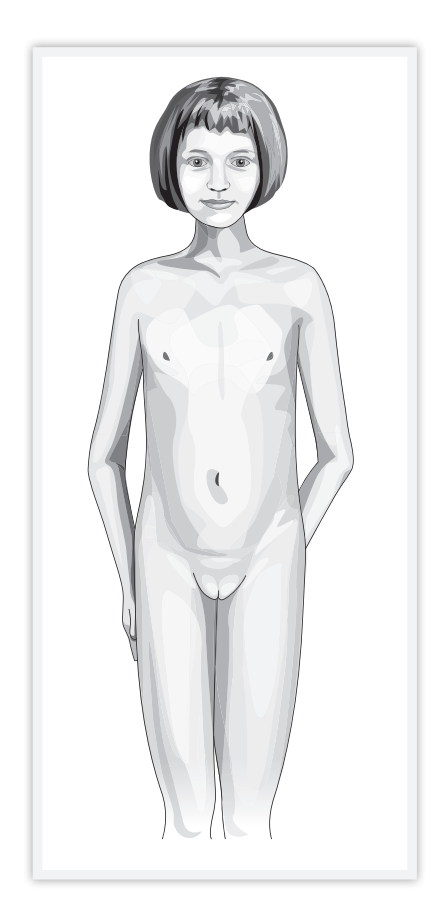
FIGURE 2-1 Tanner Stage I: Preadolescent (ages 10-14): Breasts have elevation of nipple only. There is no pubic hair except for vellus hair, which is fine body hair like that noted on abdomen

The onset of puberty depends on a changing body accumulation of adipose tissue. As a consequence, this event marks the beginning of a tension between biologic development and the social context in which it occurs. Our culture today demands perfection, which causes many young women to suffer great anxiety about their bodies. The challenges that present for young women vary based on ethnicity, self-esteem, the social environment, and the contrast between the individual adolescent's sense of herself and society's perceived standard