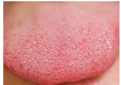
FIGURE 3.1 On the tongue, the majority of the taste buds sit on raised protrusions of the tongue surface called papillae. On average, the human tongue has 2,000–8,000 taste buds.

papillae Rough bulges or protuberances in the surface of the tongue, some of which contain taste buds.