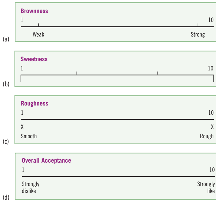
FIGURE 3.4 Examples of line scales. (a) Brownness. (b) Sweetness. (c) Roughness. (d) Overall acceptance.