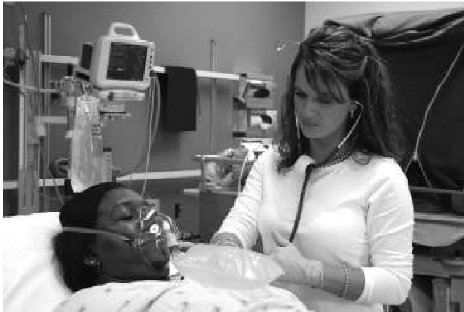
Figure 1-1 A healthcare professional with a patient.

on ethics, guided their beliefs and actions. This, then, would support the belief that ethics, on some level, is “built into” our very being (intrinsic). How each of us interprets each ethical situation, though, varies greatly.