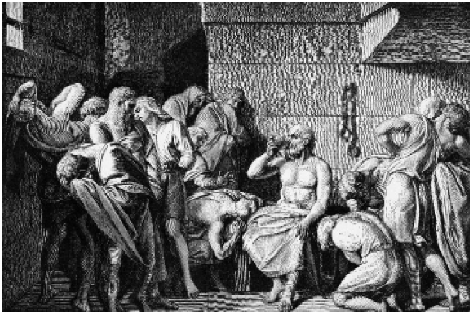
Figure 1-3 Socrates drinking the Conium. Engraved by unknown engraver and published in Pictorial History of the World's Great Nations, United States, 1882 .

He seldom stayed home, though he had a wife and three children; according to some, he even took a second wife, which was permitted by a polygamy law of the time. Instead, on any given day, he could be found near the court square teaching. He was seen as arrogant by some because he was so blunt. In fact, his blunt depiction of local leaders soon made Socrates a target of public officials. He once said