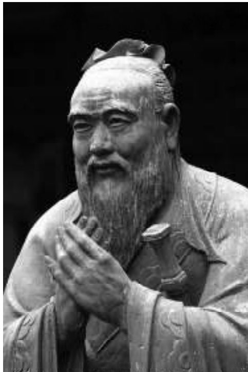
Figure 1-2 Statue of Confucius at Confucian Temple in Shanghai, China.

Confucius (born with the name Kong) was born in 552 BC in Lu, China ( Figure 1-2 ). During his life, the slave system in the East was on the brink of collapse. As with any of us, he was heavily influenced