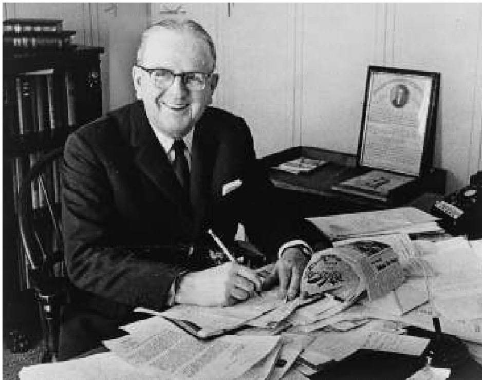
Figure 1-5 Norman Vincent Peale.

any moral decision, it can be presupposed that if something is not legal, it is not ethical. Therefore, if you ask yourself, “Is it legal?” and the answer is “no,” there is no need to go further in the Three-Step Model.