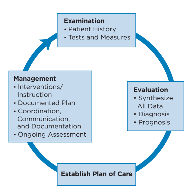
FIGURE 1-1 The patient evaluation and management system.

These predominant hypotheses then lead the physical therapist to evaluation , diagnosis , and prognosis . These are separate but interrelated factors important for determining the initial plan of care as well as for communicating professional opinions about the patient's condition.<sup>1,2</sup> The evaluation process requires synthesis of all data collected during the examination and helps to answer the question, "What does it all mean?" Diagnosis and prognosis are actually two