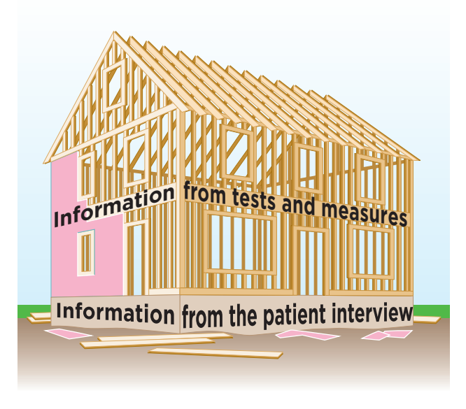
FIGURE 1-2 Consider the patient examination analogous to the process of building a house.

Chapters 2 through 4 discuss various aspects of the initial patient interview, also considered the subjective history or patient history .