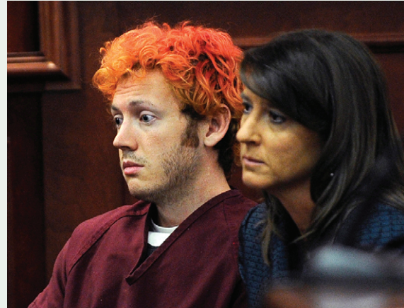
James Holmes sits in court during his trial.