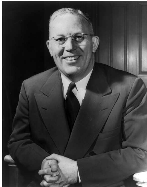
During the 1960s, Chief Justice Earl Warren presided over a great expansion of due process rights for those accused of crimes.

The process of incorporation of the Bill of Rights occurred only gradually and reflected a major split within the Supreme Court. In 1947 in Adamson v. California , Justice Hugo Black strongly called for total incorporation, arguing that the authors of the Fourteenth Amendment originally intended the Bill