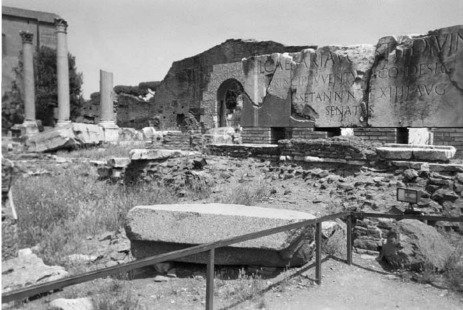
FIGURE 1-2 The ruins of the ancient Roman senate.