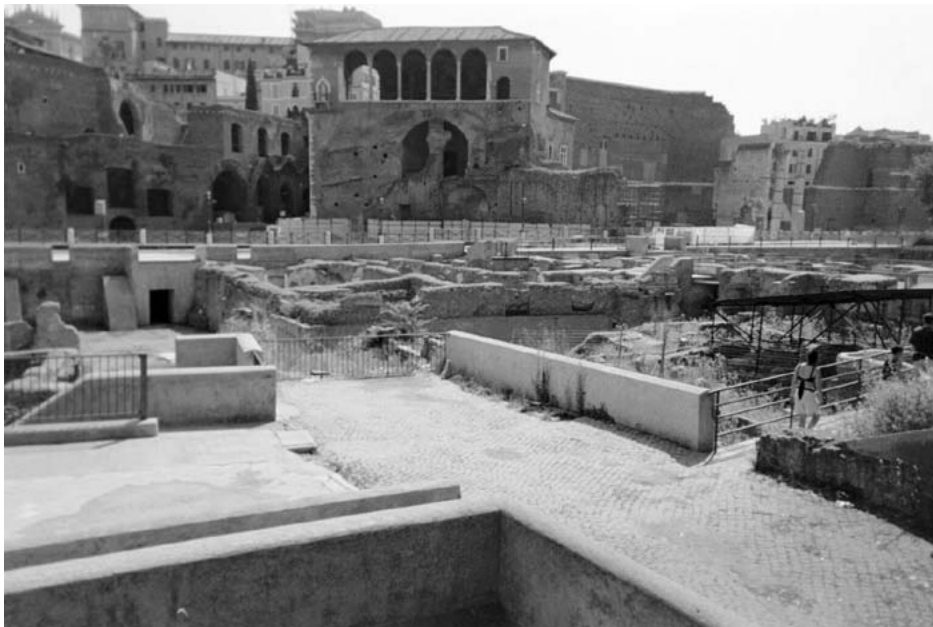
FIGURE 1-1 Ancient ruins of the Roman empire: Early “leadership” documentation can be attributed to ancient Egyptian, Greek, Roman, Chinese, and Persian societies.

Most modern studies and research have been U.S. or “Western” based, although recently some effort has been devoted to international applications of leadership. This has not always been the case: In ancient times, “the subject of leadership was not limited to the classics of Western literature. It was of as much interest to Asoka and Confucius as to Plato and Aristotle.” 26,27 However, much of our current literature on leadership is greatly influenced by Western culture and the documentation of history through the exploits of Western leaders, such as during the time of the Roman Empire. Remnants of the Roman Empire attest to the power of leadership in society, as illustrated in Figures 1-1, 1-2, and 1-3.