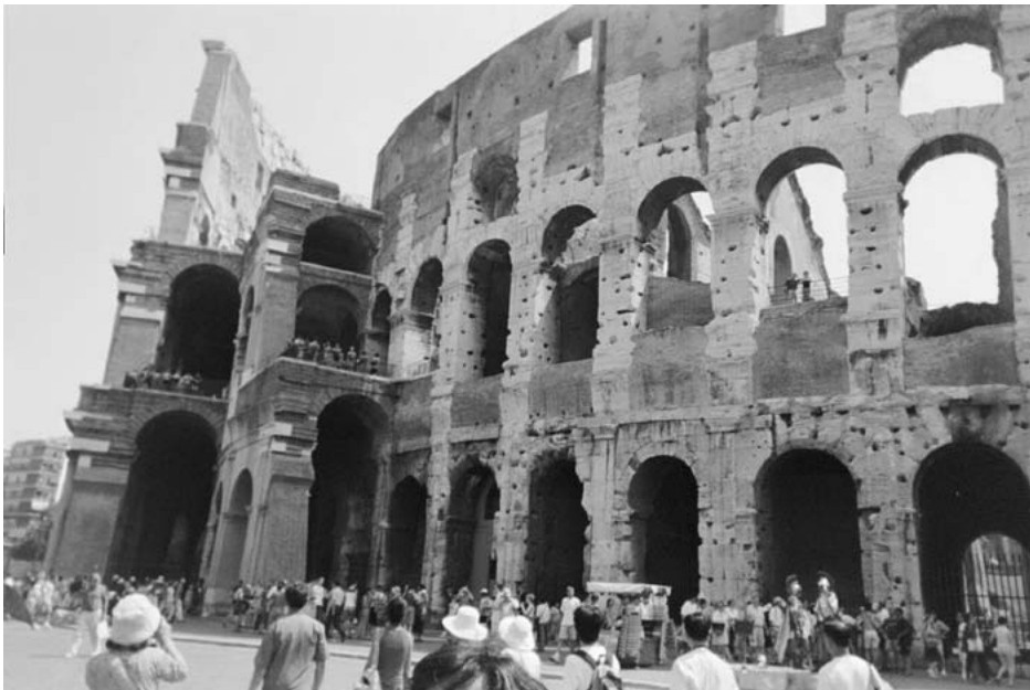
FIGURE 1-3 Signs of leadership power and influence in ancient Rome.

leadership roles. Behavioral theory gained acceptance in the 1940s; this research phase focused on which styles or behaviors leaders used and how those styles contributed to subordinate satisfaction, performance, and quality. It was