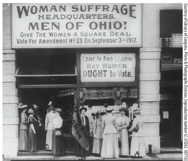
Women did not get the right to vote in the United States until 1920.

Some people had thought that the ratification of the Nineteenth Amendment would end the struggle