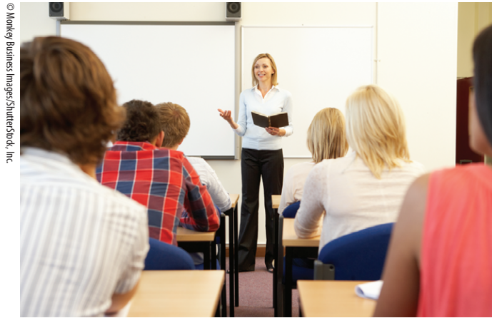
Many values influence sexual decision making.