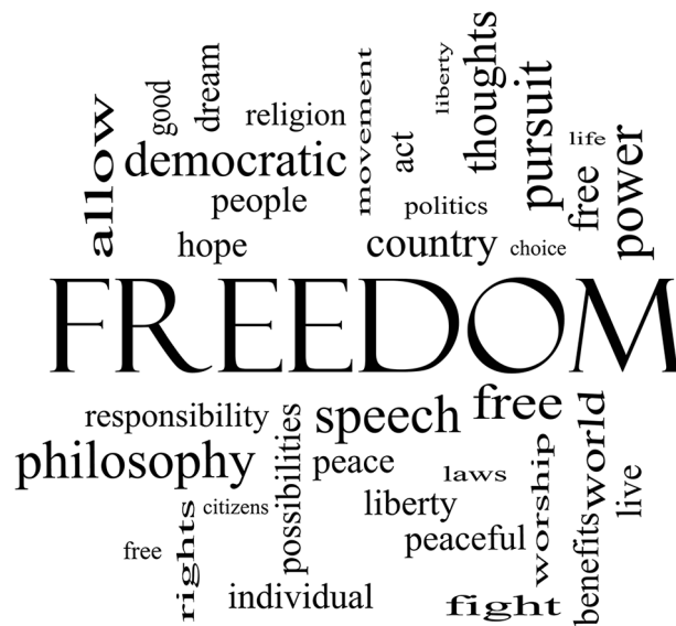
FIGURE 1-2 Freedom Speaks

always apprehension when one must share bad news; the temptation is to play down the truth for fear of being the bearer of bad news. To lessen the pain and the hurt is only human, but in the end, truth must win over fear.