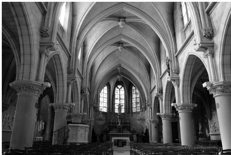
FIGURE 1-3 Religious Influence on Ethics

—UNIVERSITY OF PENNSYLVANIA HEALTH SYSTEM