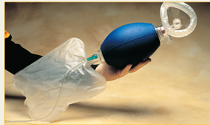
Figure 11-34 Bag-valve-mask device.

The bag-valve-mask device is the most common device used to ventilate patients in the prehospital environment Figure 11-34 ▶. With an oxygen flow rate of 15 l/min and a reservoir attached, the bag-valve-mask device can deliver almost 100% oxygen to the patient. Bag-valve-mask ventilations are indicated for apneic patients and for patients who are breathing inadequately, as long as they can tolerate the device.