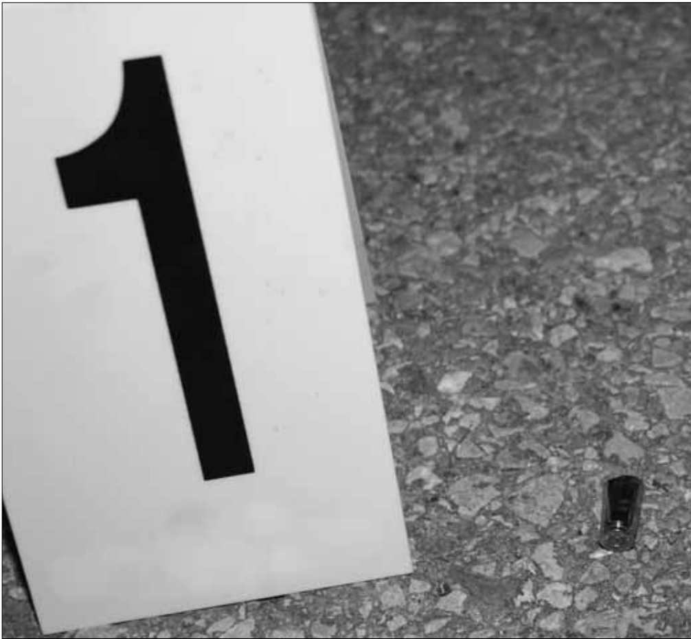
Figure 1–7 A bullet in a murder case is only circumstantial evidence without more evidence that a crime has been committed.

Bullets generate secondary conclusions rather than primary ones in a direct sense. A case of recent prominence involving Thomas Capano, the former Delaware Deputy Attorney General, who killed the Governor of Delaware’s secretary, Anne Marie Fahey, is an instructive example of a conviction based solely on circumstantial means. No body ( corpus delicti ) was ever discovered. But motive, opportunity, blood, fibers, and a diary—all of which are circumstantial—were convincing enough for a jury to not only find guilt, but to also issue the death penalty.