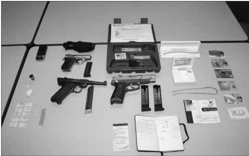
Figure 1–1 Evidence collected through a drug and burglary seizure.

Law enforcement's basic tasks are guided by constitutional prescriptions, which defense counsel knows only too well. During the litigation process, prosecution and defense counsel, with staffs of investigators and legal assistants, evaluate the quality and content of evidence, file pleadings in the form of complaints, motions, admissions, and stipulations, and perpetuate admissibility.