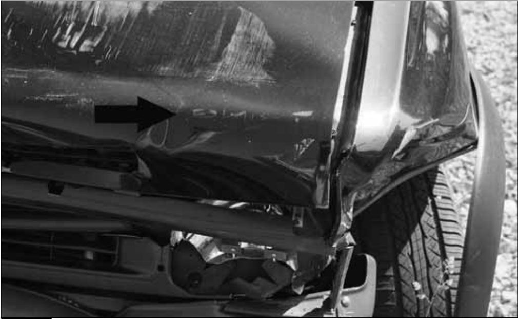
Figure 1–4 “BRING” from Sebring imprinted on the hood of a wrecked automobile when it rear-ended another vehicle.