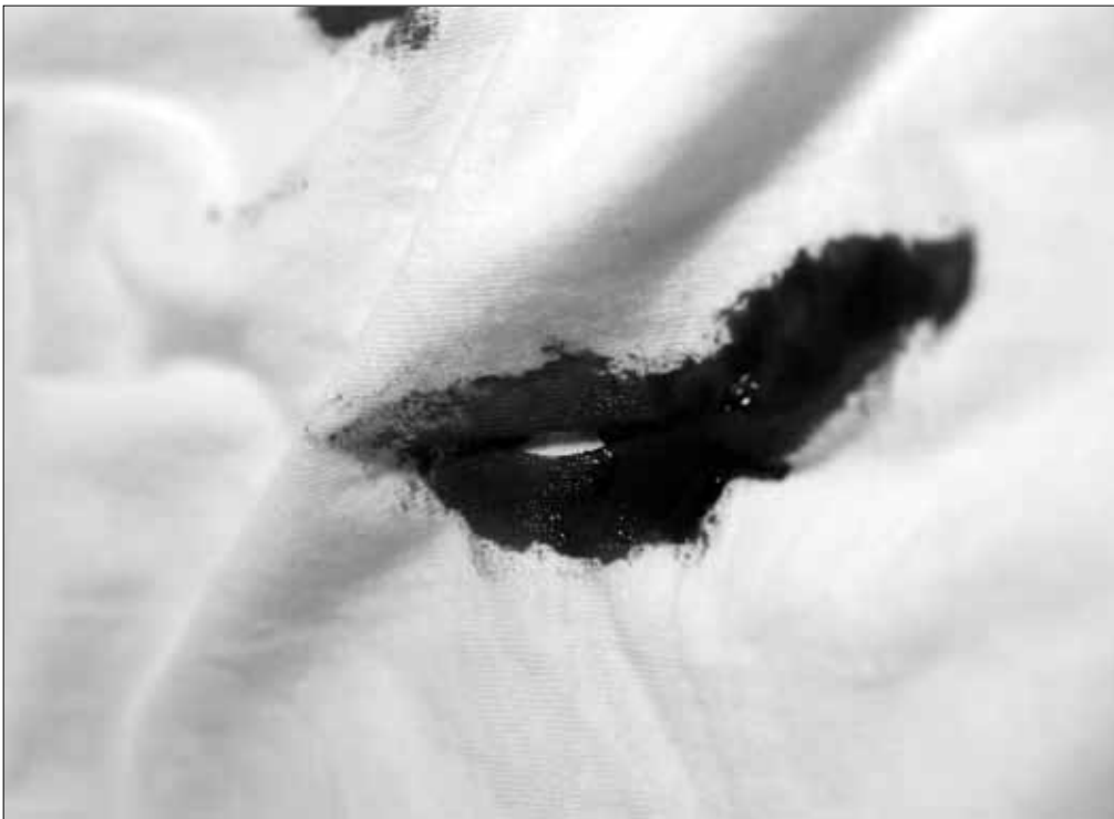
Figure 1-11 Is blood stained clothing proof of criminal conduct?

Is the demonstration of blood, a victim's clothing, and the actual victim's body sufficient to meet the criminal burden? Are noncriminal explanations possible? See Figure 1-11 and Figure 1-12 .