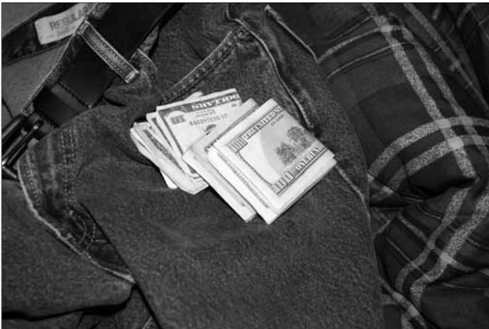
Figure 1–9 Paper money can prove a drug trade by inference.