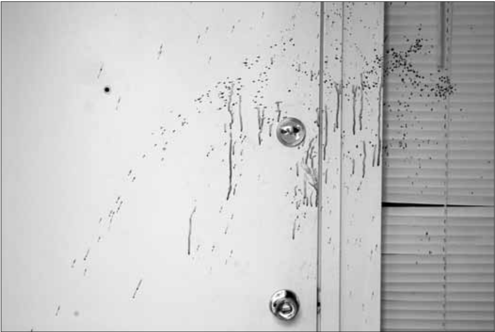
Figure 1-10 Do blood spatters alone prove criminal activity?

Source: Reprinted from American Jurisprudence Pleading and Practice Forms, AJPP Evidence § 75 with permission of Thomson Reuters/West.