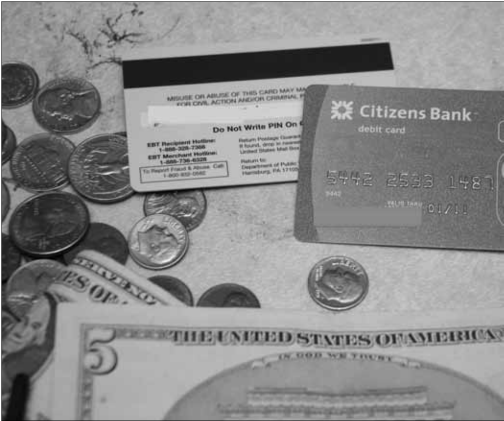
Figure 1–2 Valuables left at a suspicious death scene are collected for evidence.