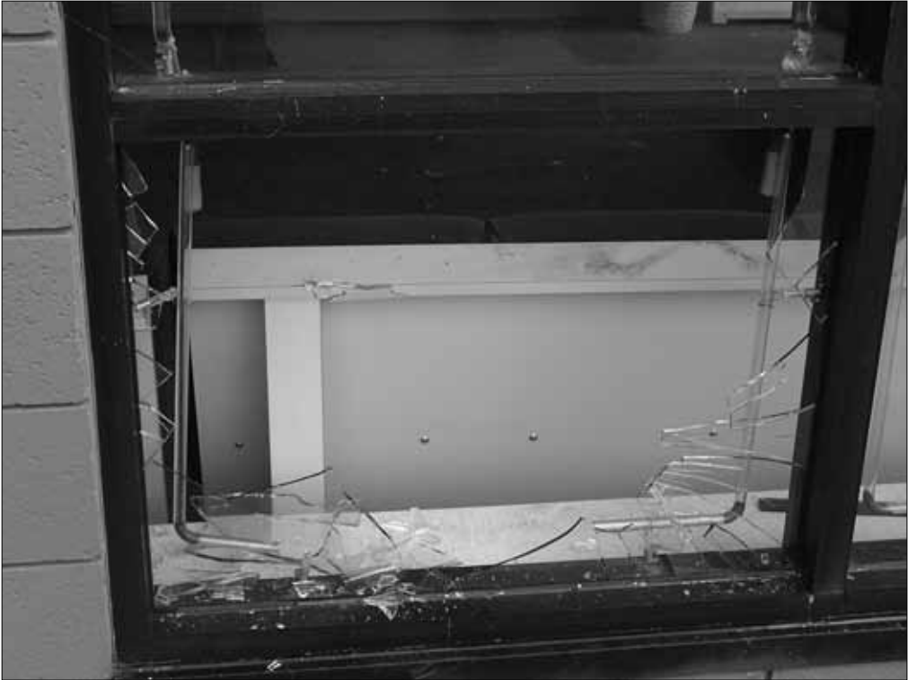
Figure 1–8 A broken window is only circumstantial without additional evidence of criminal activity.

In a typical charge of homicide, evidentiary sources potentially include blood, fingerprints on a weapon, a ballistics report, bodily fluids, motive, agency, past relationship, an expert's report, or hairs and fibers located at the crime scene—all of which are circumstantial.