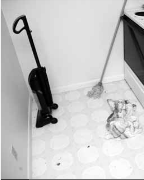
Figure 1-12 Can criminal conduct be inferred from the remnants of cleaning a large amount of blood?