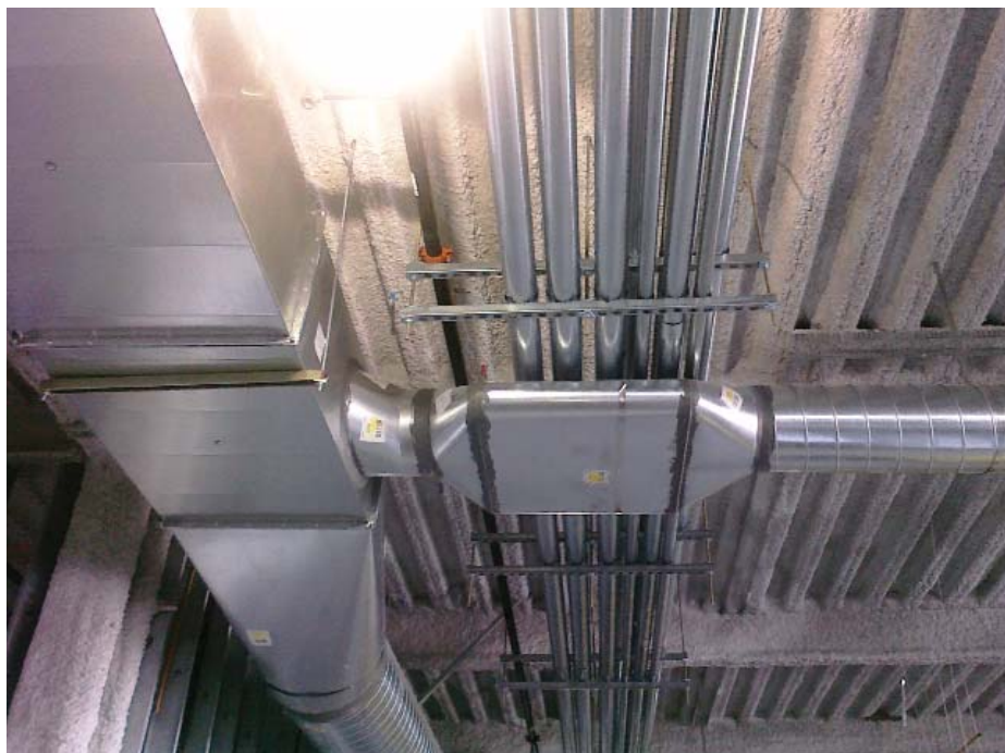
Figure 1: Application of BIM to avoid interferences

True agility requires careful management of the window of opportunity: the time between one event and the next. Every “fire” or urgency, and jobsites do have many, requires a certain amount of time to identify (time to detect), formulate and